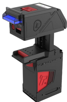
Safe Interface with 500 note cashbox