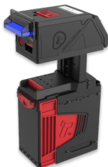
Safe Interface with 1000 note cashbox