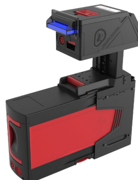
Safe Interface with 2200 note cashbox