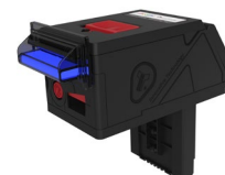
Safe Interface with Freefall