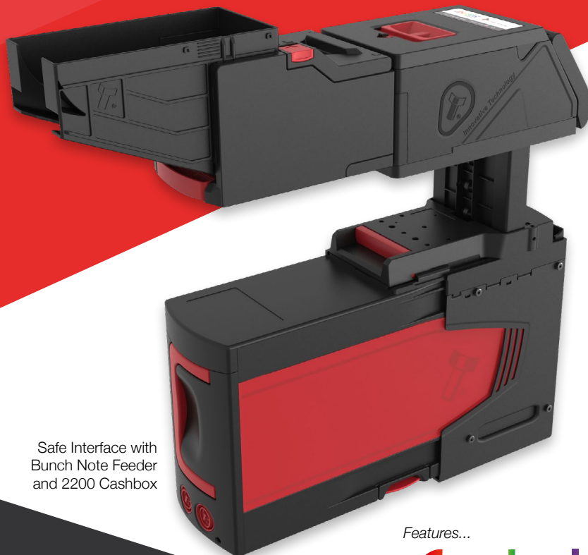
Safe Interface with Bunch Note Feeder and 2200 Cashbox

"Advanced note validator for SMART Safes"