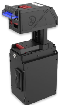
Safe Interface with TEBS cashbox